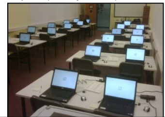
SET UP FOR ON-SITE COMPUTER-BASED TASK